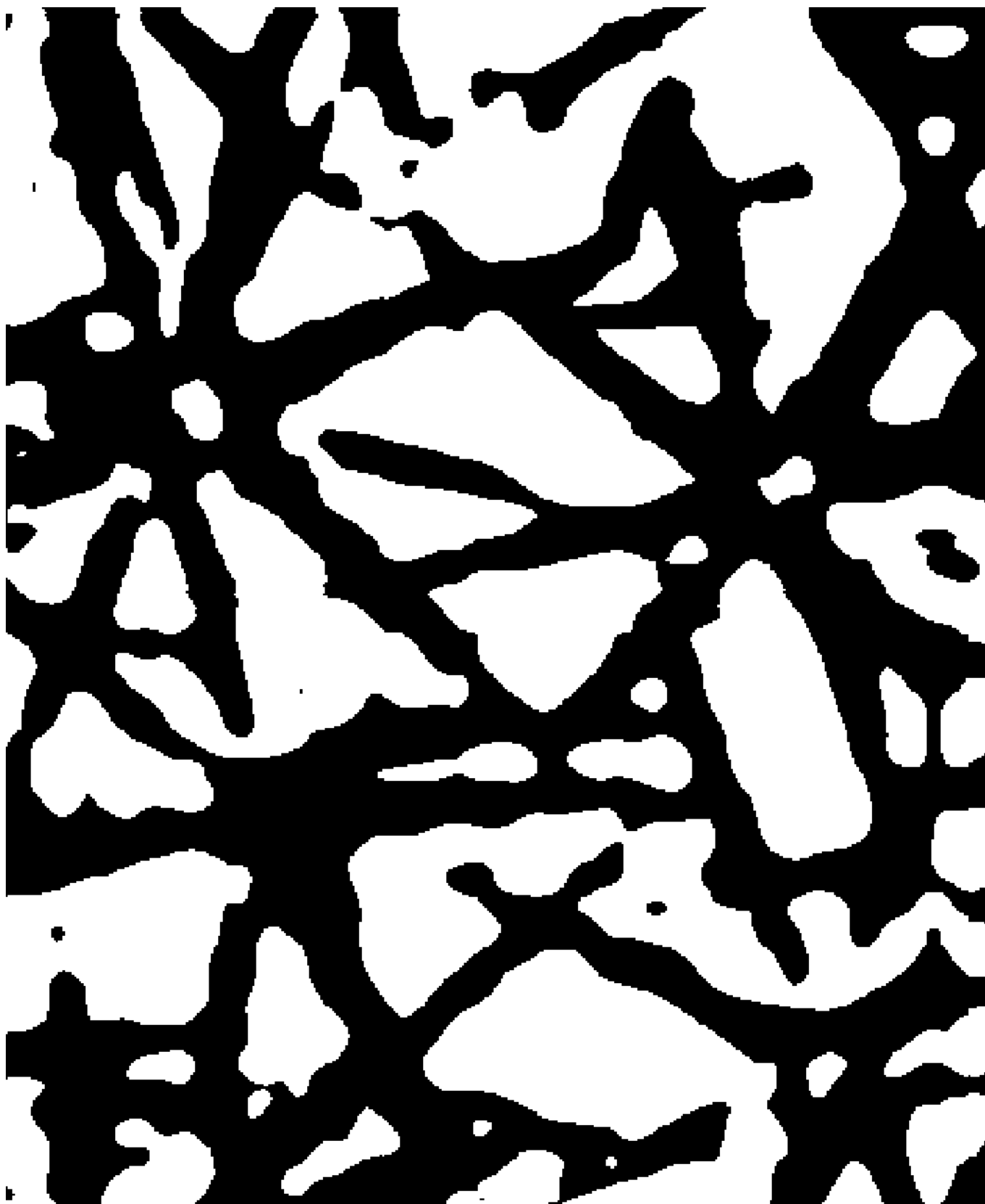
Pattern illustration 1:1